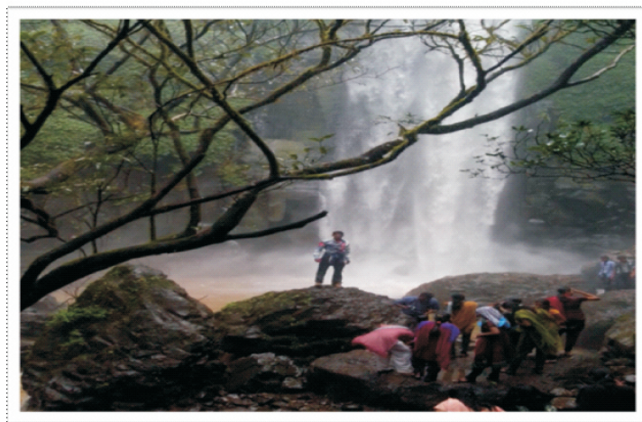
Photo Plate No. 2 Barki Waterfall