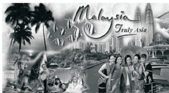
Authors own Interpretation