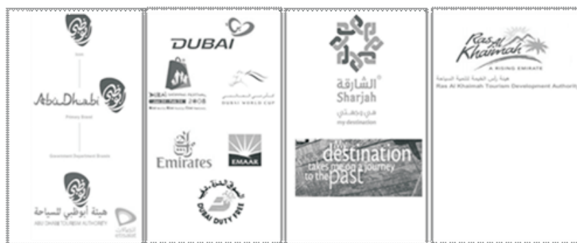
Authors own Interpretation.