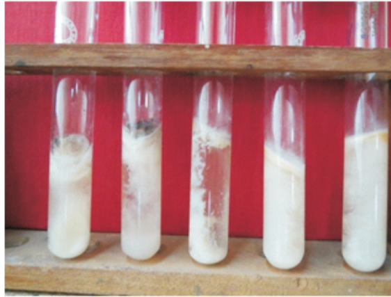
Figure-05: Milk protein casein gets accumulated as a clot within overnight incubation.