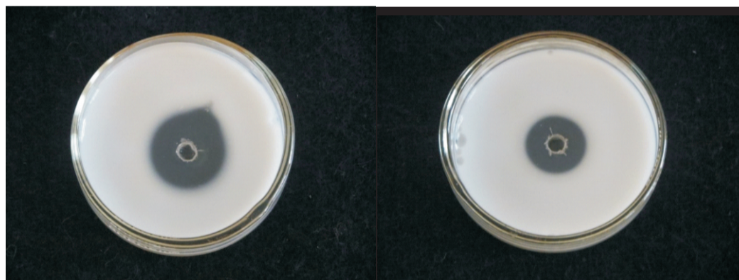
Figure-04: Zone of casein hydrolysis at 37°C & 55°C temperature.