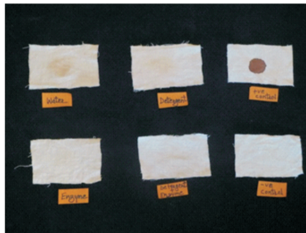
Figure-06: Blood stain removal within 15 min with enzyme and enzyme+ detergent combination when compared with controls.