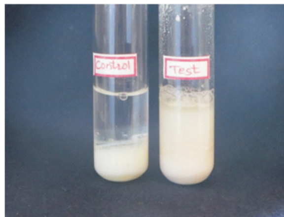
Figure-07: Coagulated egg protein gets dissolved after 72 h of incubation at 37°C temperature.