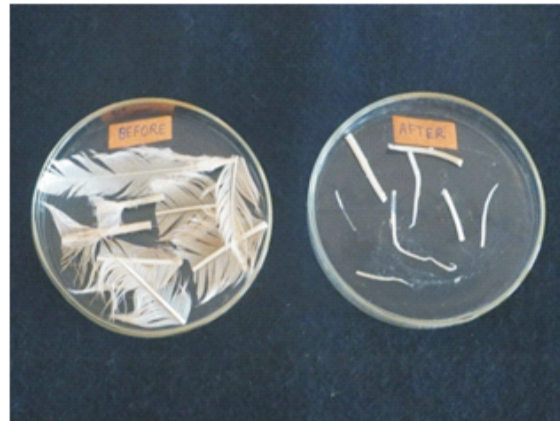
Figure-02: Complete removal of feather hairs within 4 days of incubation at 37°C temperature.