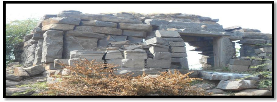
Trikuteshwara (Ishwara) Temple in Umaraj.