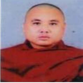
Gunisariya Annamalai nagar